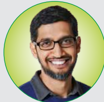
Mr. Sundar Pichai CEO, Google and Alphabet Inc.