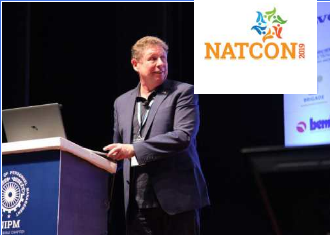
38 th NIPM National Conference 2019 ▲ Bengaluru

National Institute of Personnel Management (NIPM) a premier organisation in association with The Asia Pacific Federation of Human Resource Management hosted "NATCON 2023" at Pune.