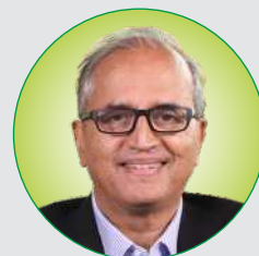
Dr. Devi Prasad Shetty Cardiac Surgeon, Chairman & Founder, Narayana Health, Bengaluru