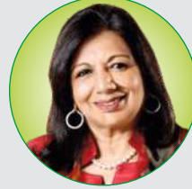
Ms. Kiran Mazumdar Executive Chairperson Biocon & Biocon Biologics